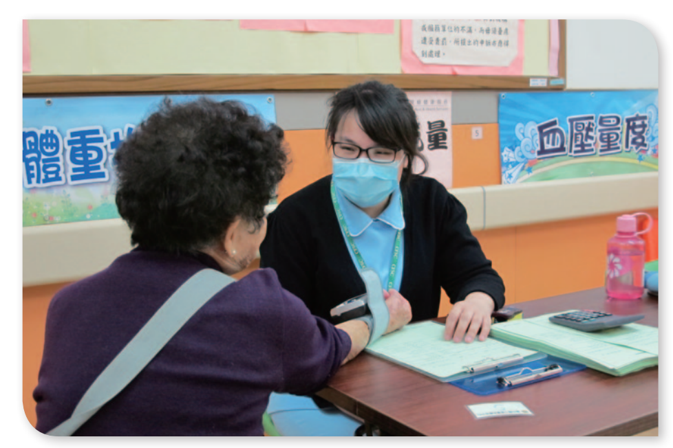
本會提供外展健康檢查服務。 We provided outreach health check

As a primary health care service provider, it has always been our mission to raise public awareness and concern about healthy lifestyle, of which about nutrition awareness and attention is indeed an indispensable part. Our dietetic service was newly introduced in last year to further enhance the promotion of healthy living, and to provide the public with a more comprehensive health care.