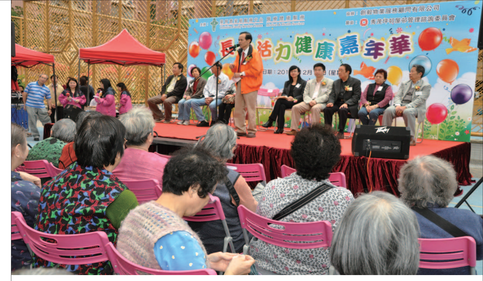
長者踴躍參與健康嘉年華。 Elderly joined the 'Healthy Elderly Carnival' actively.