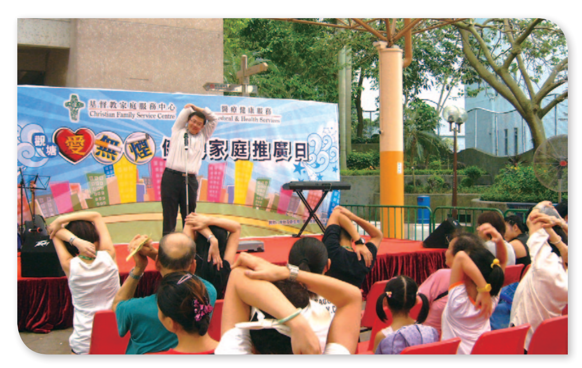
本會的醫療健康服務積極舉行各類型健康教育活動。 We organised a variety of community health educational programmes.

本會現時所提供的醫療服務包括西醫診所、牙科 診所、長者牙科外診服務、物理治療服務、營養 服務、臨床心理服務、中醫內科、針灸、跌打、 推拿、配藥及代煎服務等。在健康教育推廣方面, 則提供護士診所服務、戒煙服務、保健計劃、外 展健康指導、防疫注射,以及講座、小組、健體 運動班、展覽、社區活動等各類型健康教育活動。